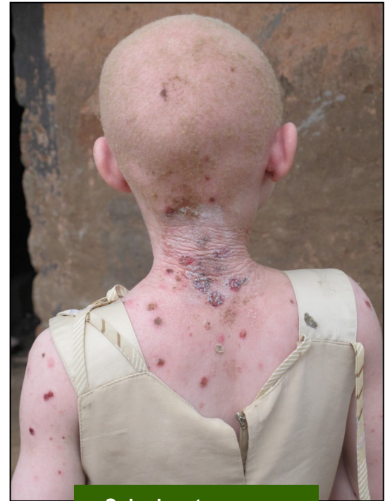
Solar keratoses on a young girl with albinism typical of children with albinism in Uganda.